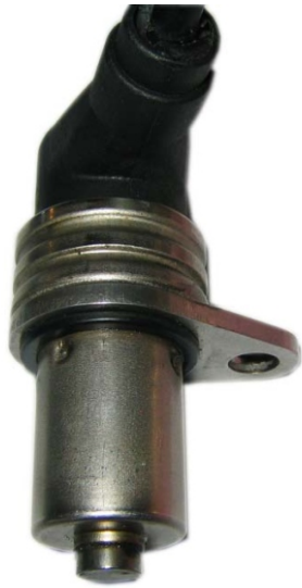
Figure C05.1 - BMW M50 Cam Angle Sensor